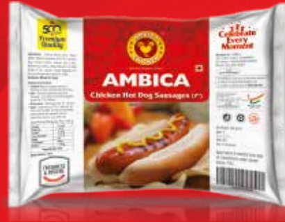
Chicken Hotdog Sausages