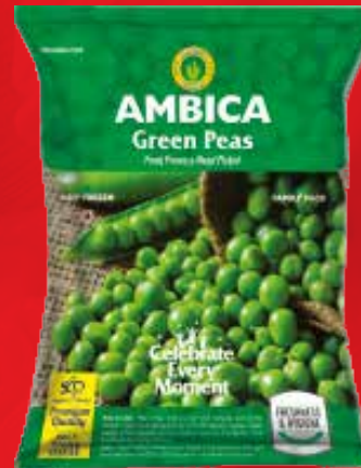
Ambica Green Peas