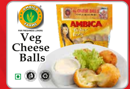
Veg Cheese Balls