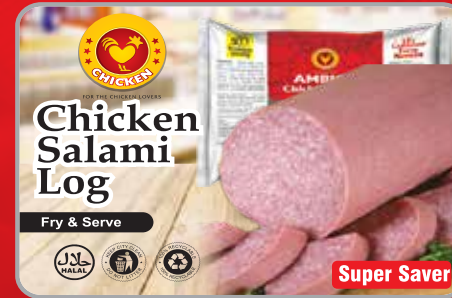
Chicken Salami log