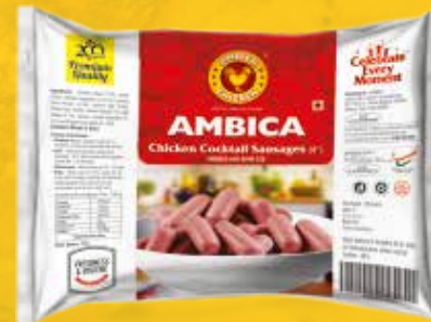
Chicken Cocktail Sausages