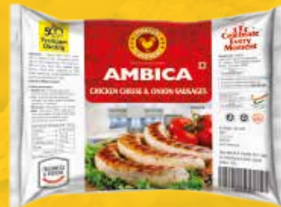
Chicken Cheese & Onion Sausages