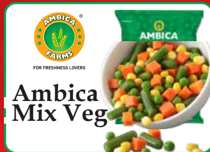
Ambica Mix Veg