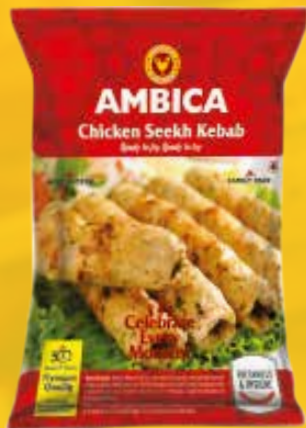
Chicken Seekh Kebab