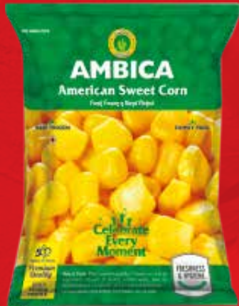
Ambica Sweet Corn