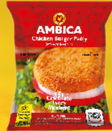
Chicken Burger Patty