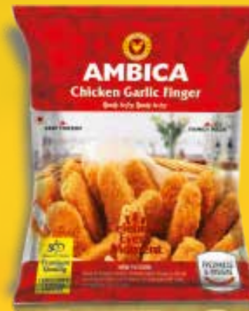
Chicken Crispy Finger